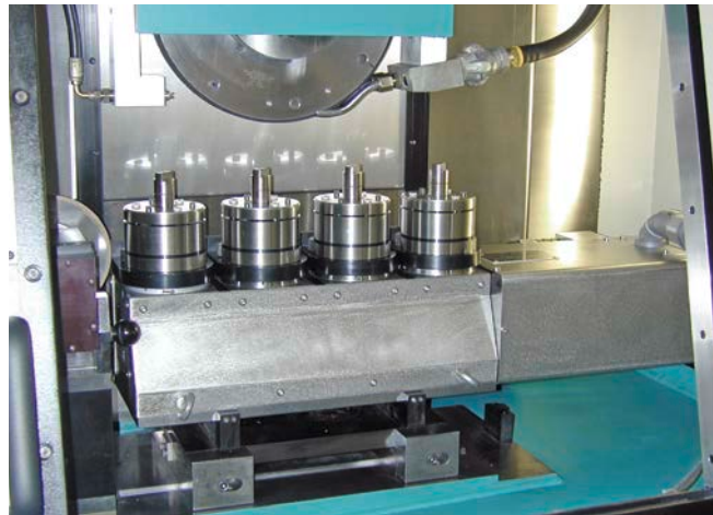
Processing chamber with clamping device

* Maximum grinding wheel diameter and travel can change due to work piece and fixture size